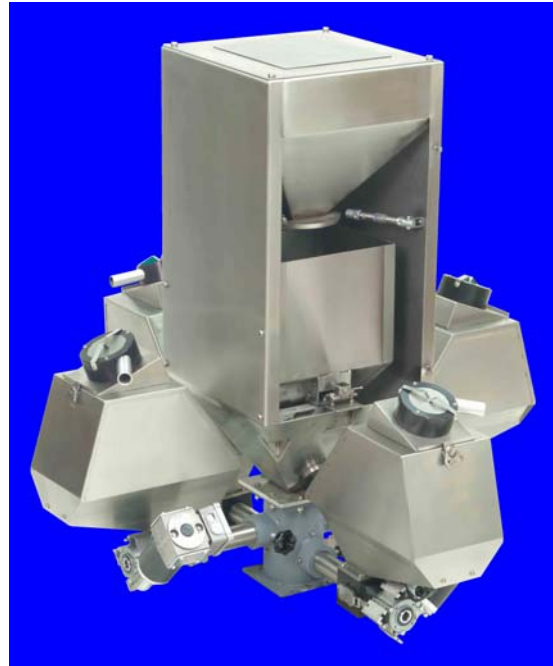
Quadruple ColorSave plus virgin weighing hopper *

* The option of weighing the virgin material or mixture of virgin materials by the loss-in-weight hopper is unique to injection molding machines, enabling you to determine the weight of the injection molded parts from cycle to cycle and thus to evaluate product quality.