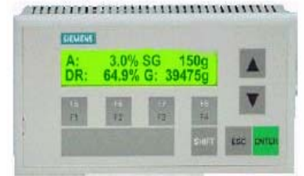
ColorSave 1000 operation panel