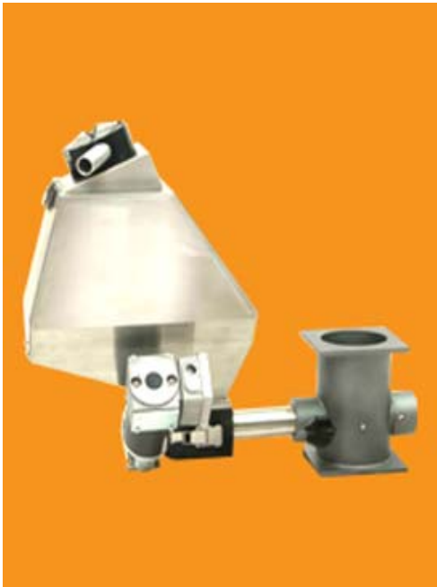
Single ColorSave 1000

The patented modular ColorSave technology enables you to save a very significant percentage of your masterbatch and additives consumption.