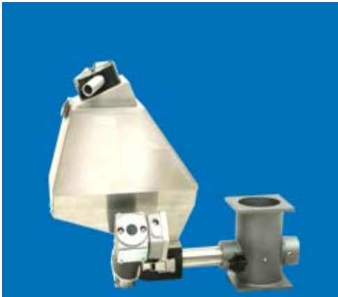
ColorSave 1000 dosing unit